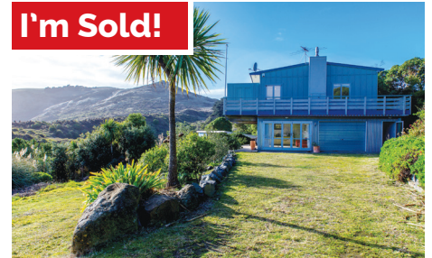
Portobello 35 Pakihau Road