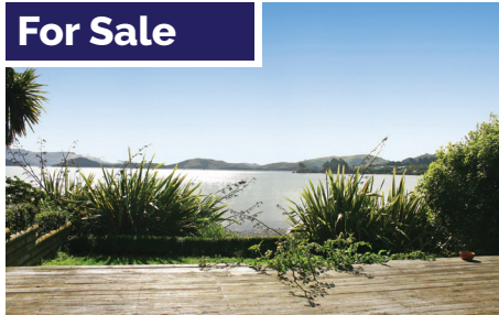
Broad Bay 656 Portobello Road