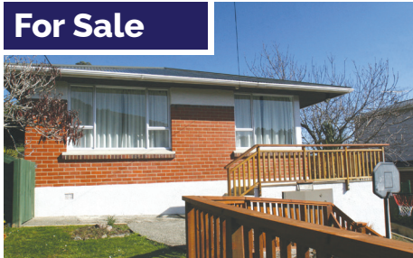
Macandrew Bay 22 Greenacres Street