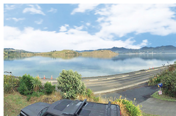
Portobello 228 Harington Point Road $240,000