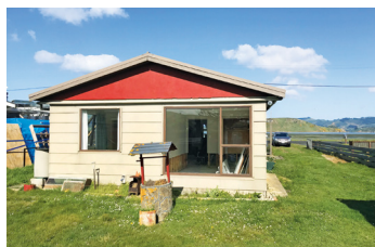
Harwood 46 Tidewater Drive $175,000