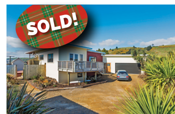
Harwood 42 Tidewater Drive $420,000