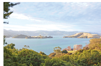
Broad Bay 61 Oxley Crescent $95,000