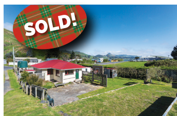
Lower Portobello 319 & 321 Harington Pt Rd $280,000