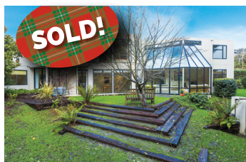
Macandrew Bay 23B Howard Street $680,000