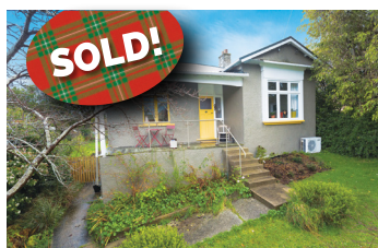
Portobello 5 Nicholas Street $285,000