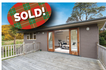
Broad Bay 23 Solar Terrace $380,000