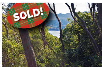
Portobello 2 Treetop Drive $92,000