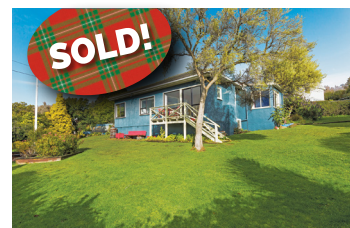
Broad Bay 2 Frances Street $330,333