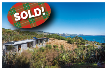
Company Bay 6 Luss Road $950,000