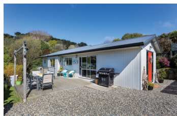
Portobello 7 Hanson Street $395,000